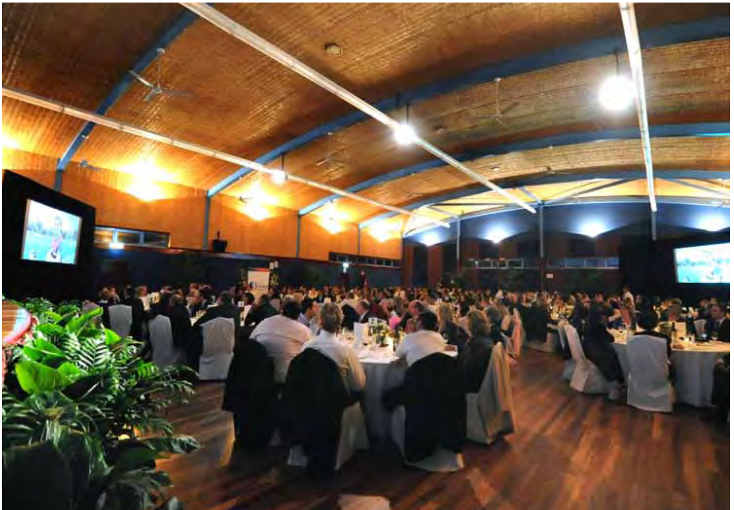
Awards Ballroom at Arthur Wren Hall