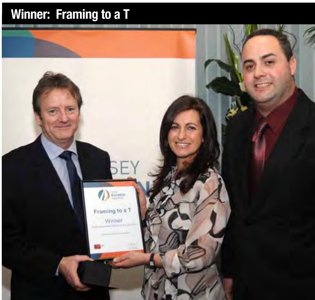
Winner: Framing to a T