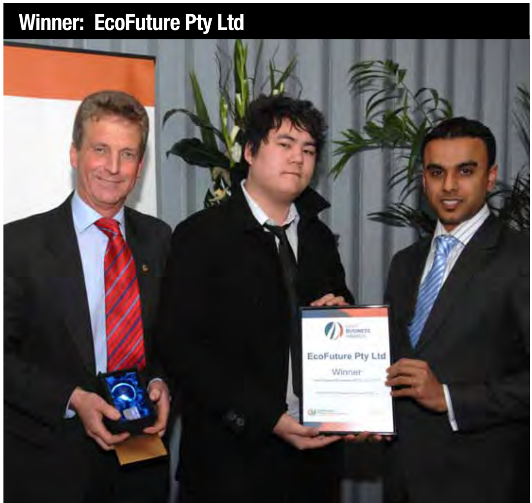
Winner: EcoFuture Pty Ltd