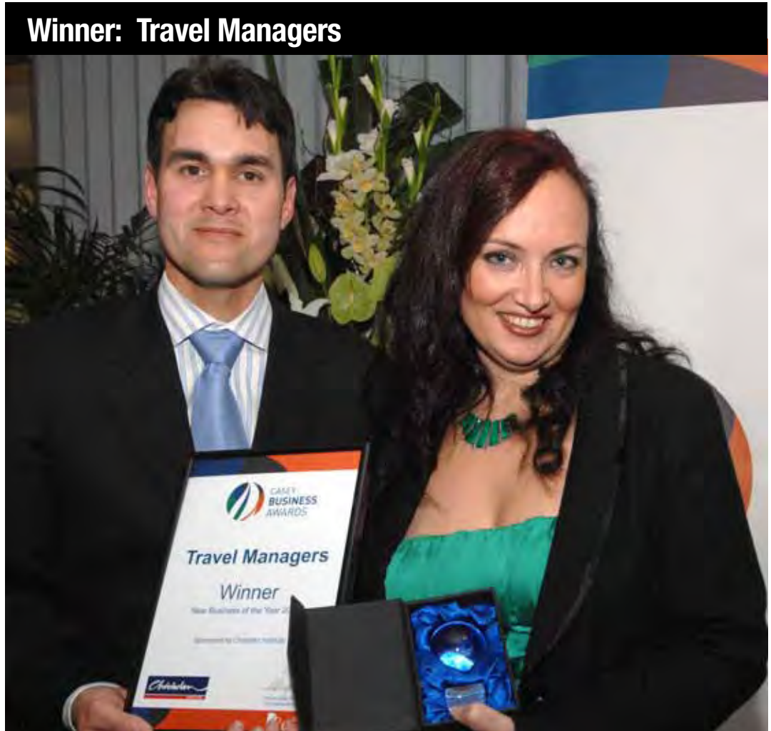
Winner: Travel Managers