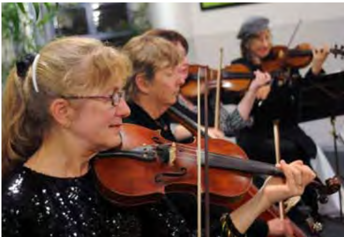
Silver Strings Quartet