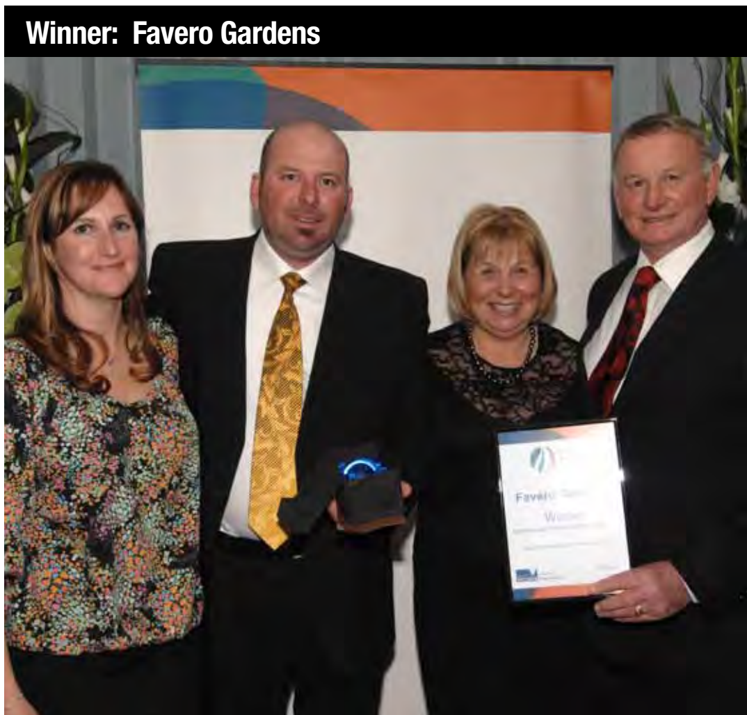
Winner: Favero Gardens