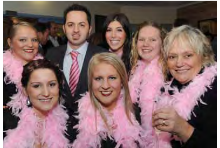
Day Spa Parties team